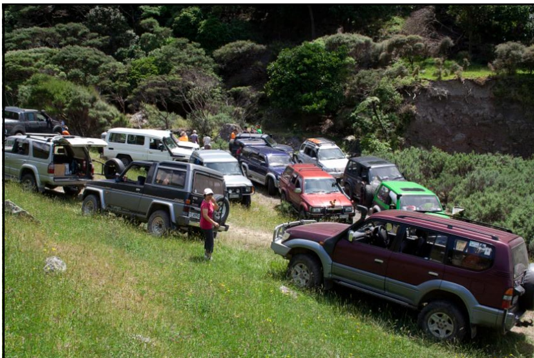
On the Kids Christmas Trip - December 2013

Some of you will remember that I disappeared on my Big OE in 2010 and we had a stand in editor for my three months absence - well I'm off again this year from the start of June till mid August. So I'm on the lookout for a volunteer to put the magazine together for me whilst I'm away - I will get the magazine published at the start of June but will need someone for the magazine published at the start of July and the start of August.