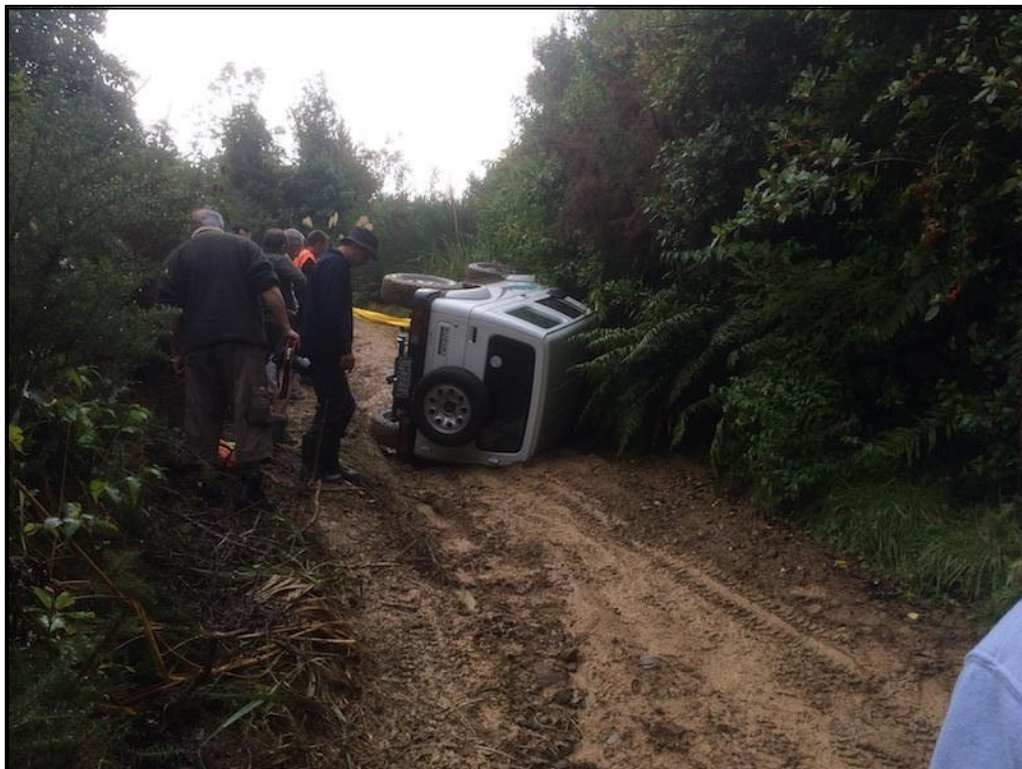
Akatarawa Forest