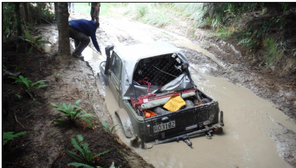
Akatarawa Forest