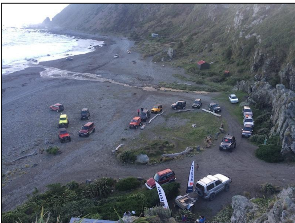
Wellington's South Coast