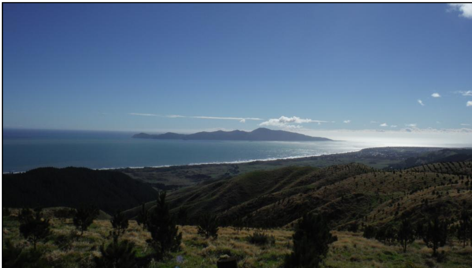
View of the Kapiti Coast